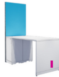
WATERFALL TABLE W/ CABINETS & PANEL - 2M X 41"H