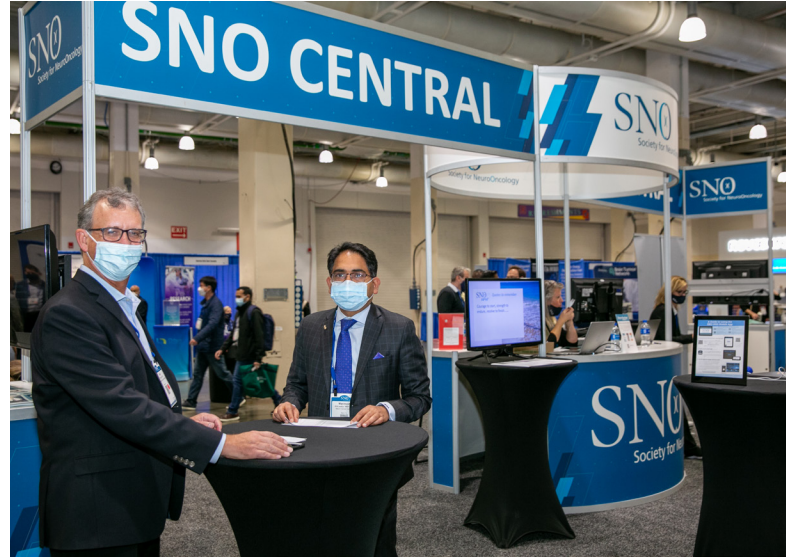
EXHIBIT COST & SPECIFICATIONS

In keeping with SNO's previous events, the conference will provide a variety of opportunities for exhibitors and sponsors to interact and connect with SNO members from around the world. The exhibit floor area is adjacent to the main plenary auditorium and the scientific posters, and will be the central nexus for attendee interactions at the meeting.