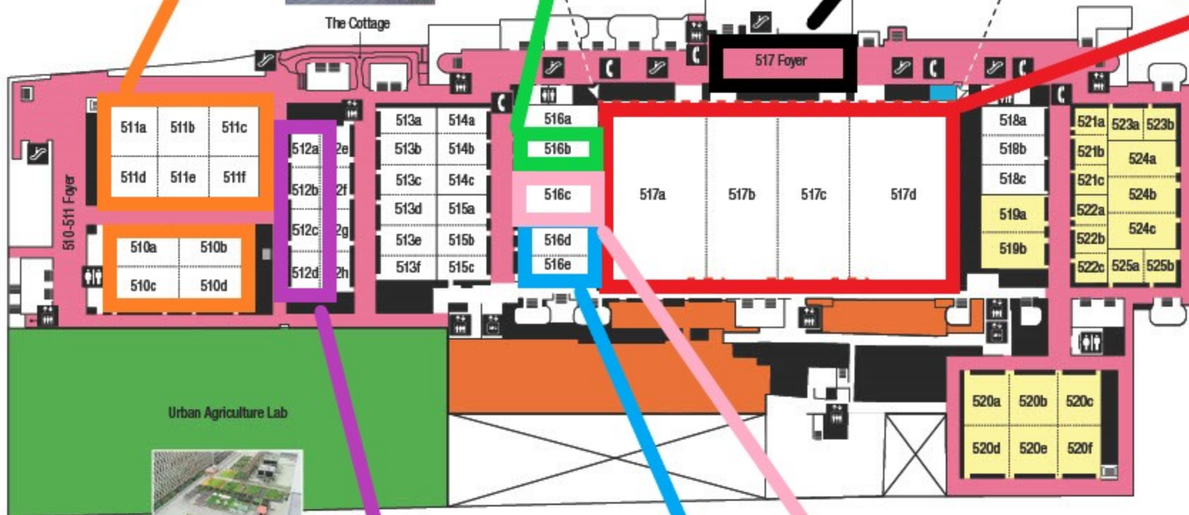
Urban Agriculture Lab