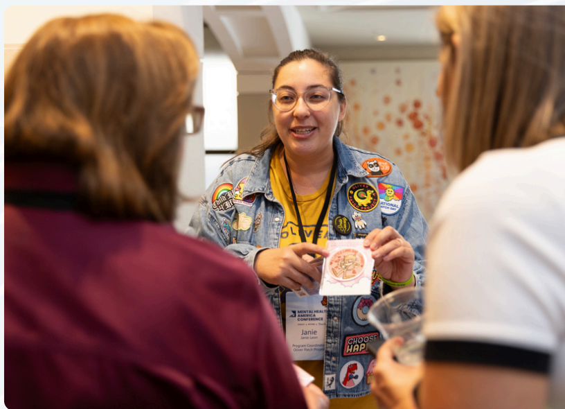
Exhibit Table $3,250

Only 40 tables available, reserve yours today!