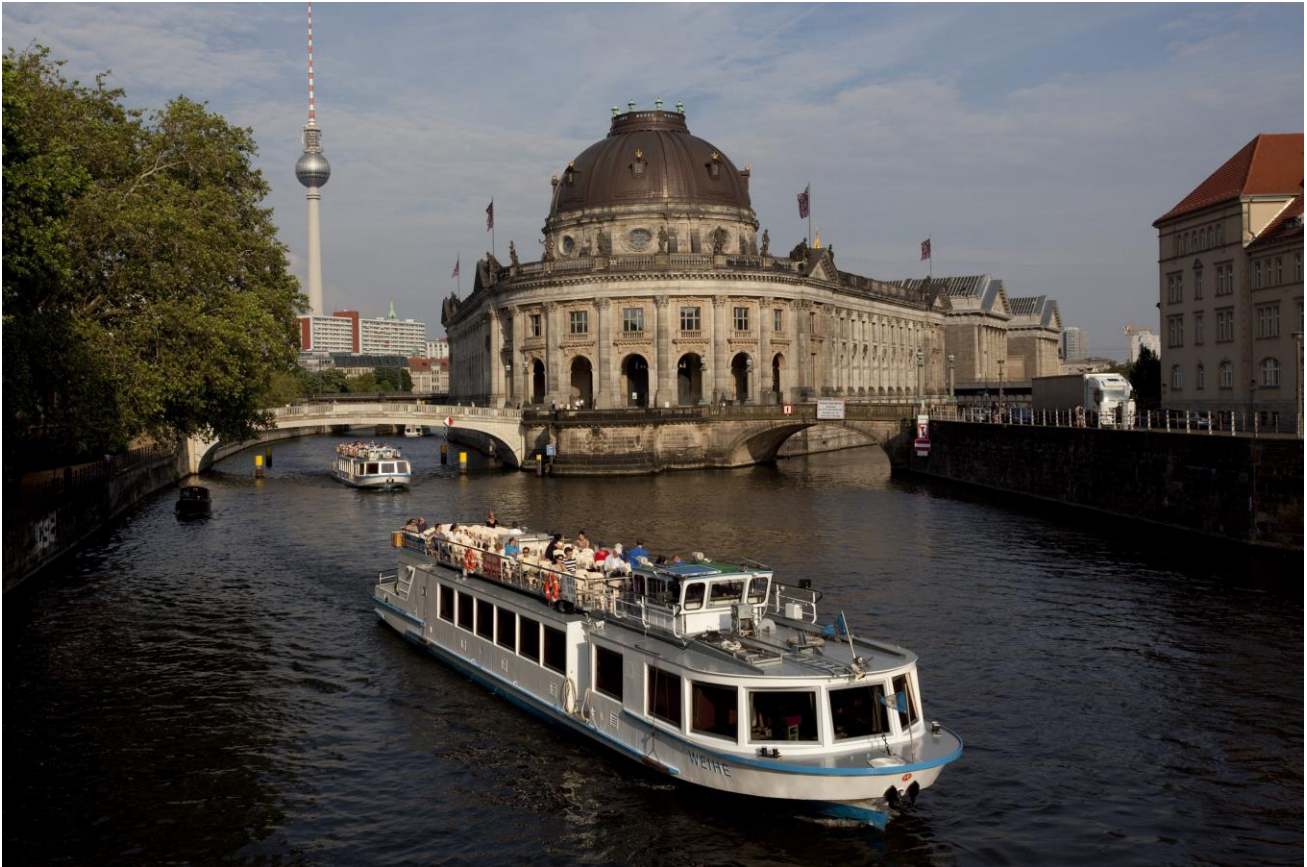
Schiffsrundfahrt an der Museumsinsel