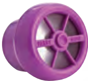
PMV® 2001 (Purple Color™)

The Passy Muir® Valve... restoring speech, swallowing, and joy for thousands every day.