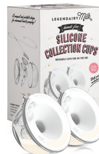
SILICONE COLLECTION CUPS