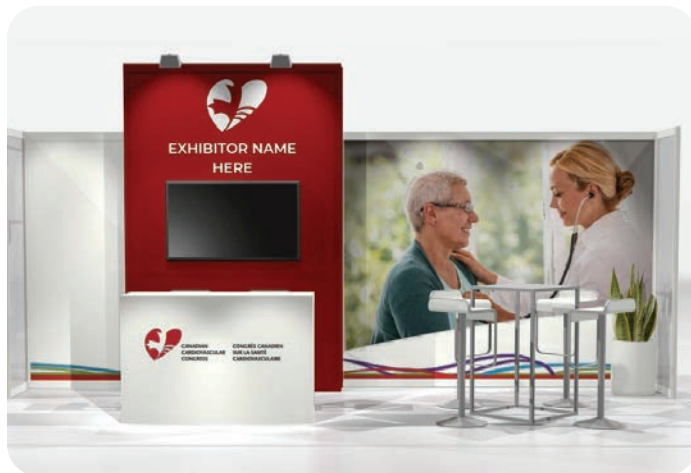
Pictured: 10'x20' premium exhibit booth

Be part of the introduction of our new Exhibit Lounge and help us set a new standard for what exhibit spaces can look like.