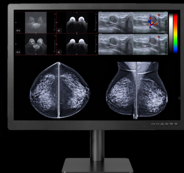
5MP and 12MP Mammo/Tomo Displays

Visit us at AHRA Booth #629 and find out!