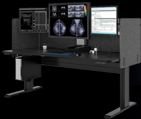
Phoenix II Ergonomic Workstation